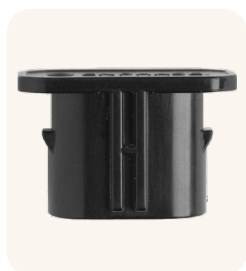
Q-SEAL-10 IQ Cable Sealing Caps (female)

Temperature Rating: -40°C to 85°C L x W x H: 53 mm x 30 mm x 28 mm