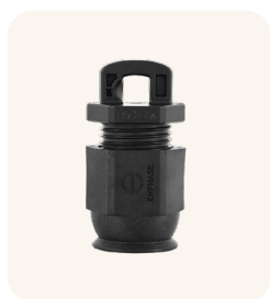
Q-TERM-10 Single-phase IQ Cable Terminator

Terminator cap for unused single-phase IQ Cable ends. Suitable for conductor cross sectional area of 2 x 12 AWG.