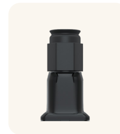
Q-CONN-10F Field-wireable connector (female)

Make connections using single-phase cable